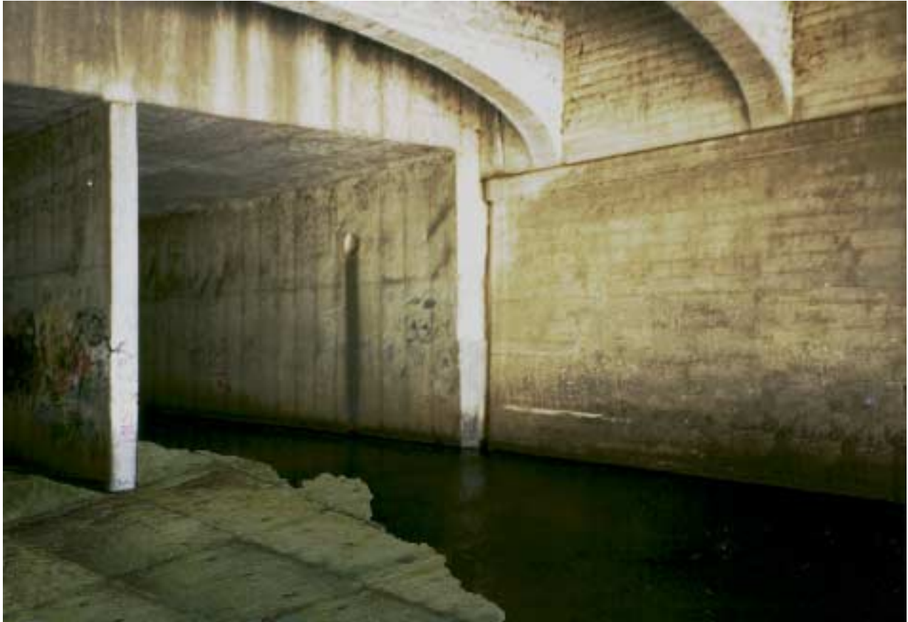
Figure 1-5 Matanzas Creek Fishway – Photo of Entrance