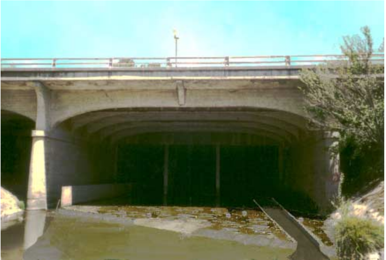
Figure 1-6 Matanzas Creek Fishway – Rendition of Proposed Modification to Culvert