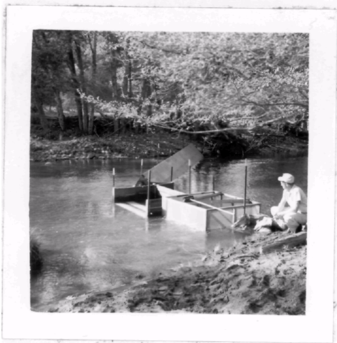
downstream trap - MARICAMA CREEK

MARICAMA CREEK TRIB TO RUSSIAN RIVER SONOMA COUNTY APRIL 1965