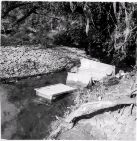
fyke net - Redwood Creek