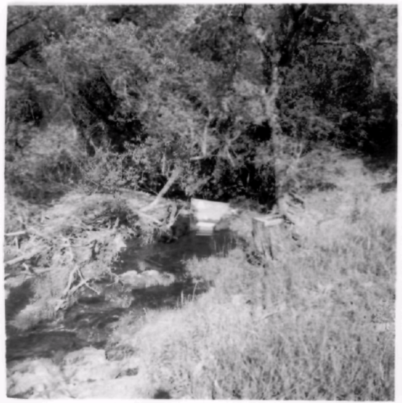
fyke net - UNNAMED TRIB