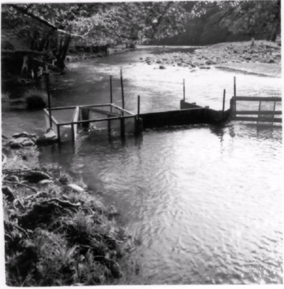
downstream trap - Mancama Creek