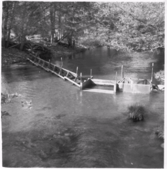
downstream trap - Mancama Creek.