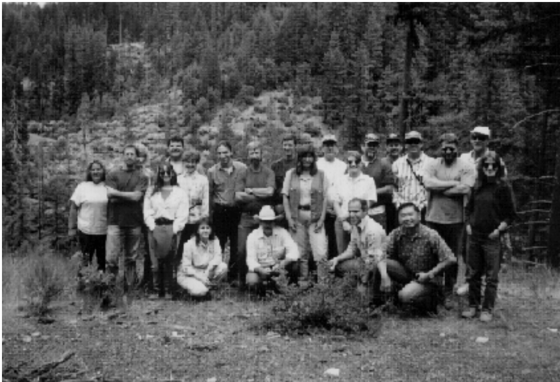
The South Fork CRMP Committee Field Trip to Butter Creek Restoration Projects.