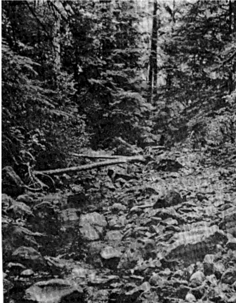
FIGURE 1-Bummer Lake Creek, Del Norte County, before logging 1967. Boulder and rubble sized materials made up the streambed.