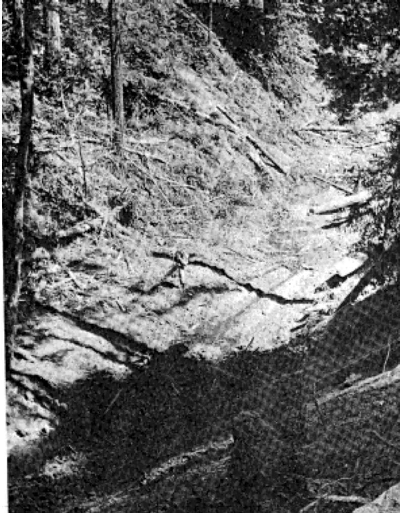
FIGURE 3-South Fork Caspar Creek, Mendocino County, immediately after road construction in 1967. A bulldozer operated extensively in the stream channel and materials from road building slid into the stream.