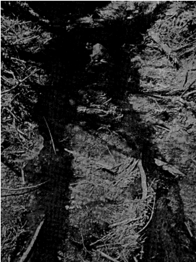
FIGURE 2-Little North Fork Noyo River, Mendocino County, immediately after logging debris removal, 1969. The stream's course was formed by bulldozer tracks.